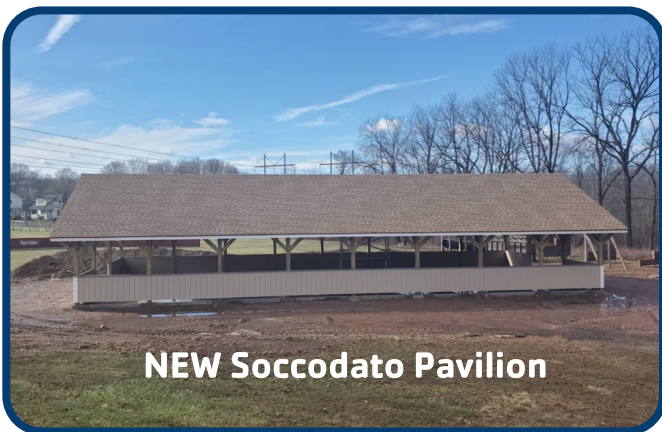
NEW Soccodato Pavilion