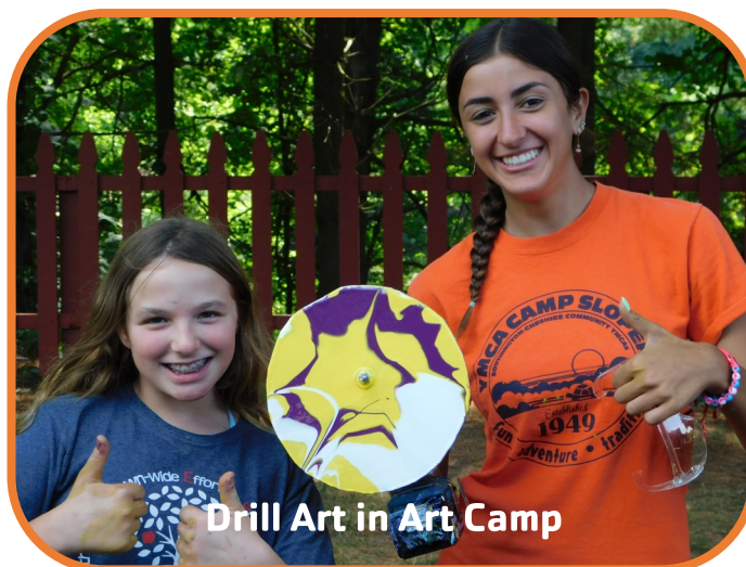
Drill Art in Art Camp