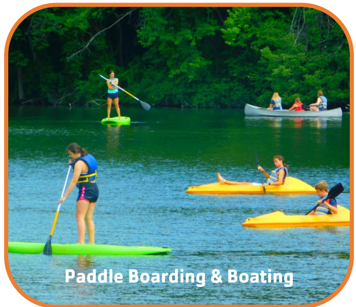
Paddle Boarding & Boating